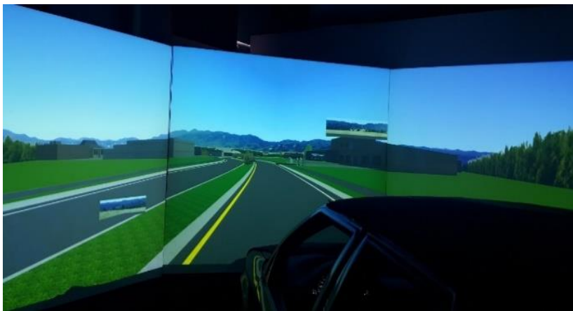
Figure 1: University of Massachusetts Driving Simulator. The fourth experimental scenario (Sc4) is depicted.

This research explores the relationship between the cross-sectional design elements and their impact on selected driver attributes such as speed profiles and lateral positioning. In this experiment a traditional collector-type base roadway of 1.5 miles with a 14 ft travel lane and an 8 ft shoulder was modeled using an advanced driving simulator. The base scenario was subsequently reconfigured with four different cross-sectional designs with various elements within the same physical right-of-way. Specific design elements included narrower lanes, bicycle lanes, a raised center median, and a curvilinear roadway profile. Twenty participants each drove five developed scenarios, which were presented in a counterbalanced fashion to mitigate any potential order effect. Participants' speed and lateral position was recorded throughout each of the drives. Across the virtual scenarios, the same performance measures were analyzed by comparing data at each of five controlled collection points (checkpoints). Experimental results were analyzed using both descriptive and inferential statistical tests.